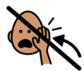
don't touch face