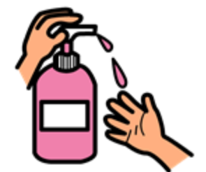
use hand sanitizer