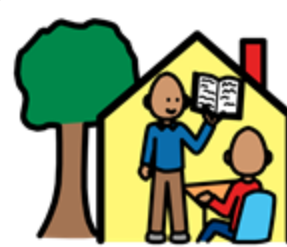
stay at home