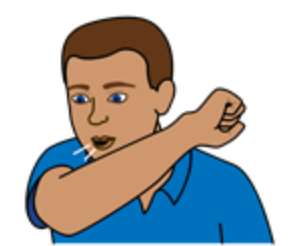
cough in elbow