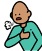
shortness of breath