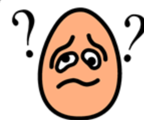
I don't understand