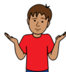
I don't know